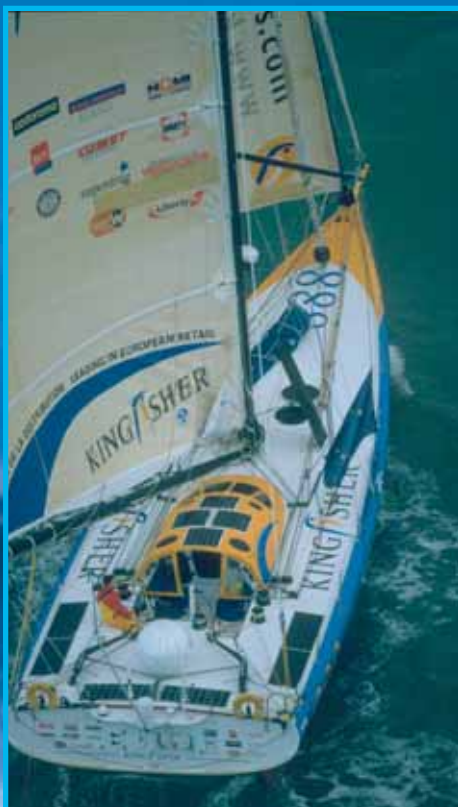
Kingfisher during the race